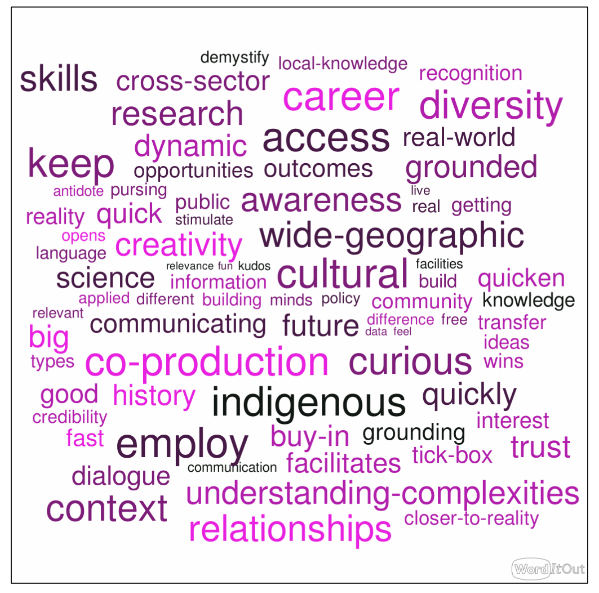
Figure 1: Benefits for science/scientists.