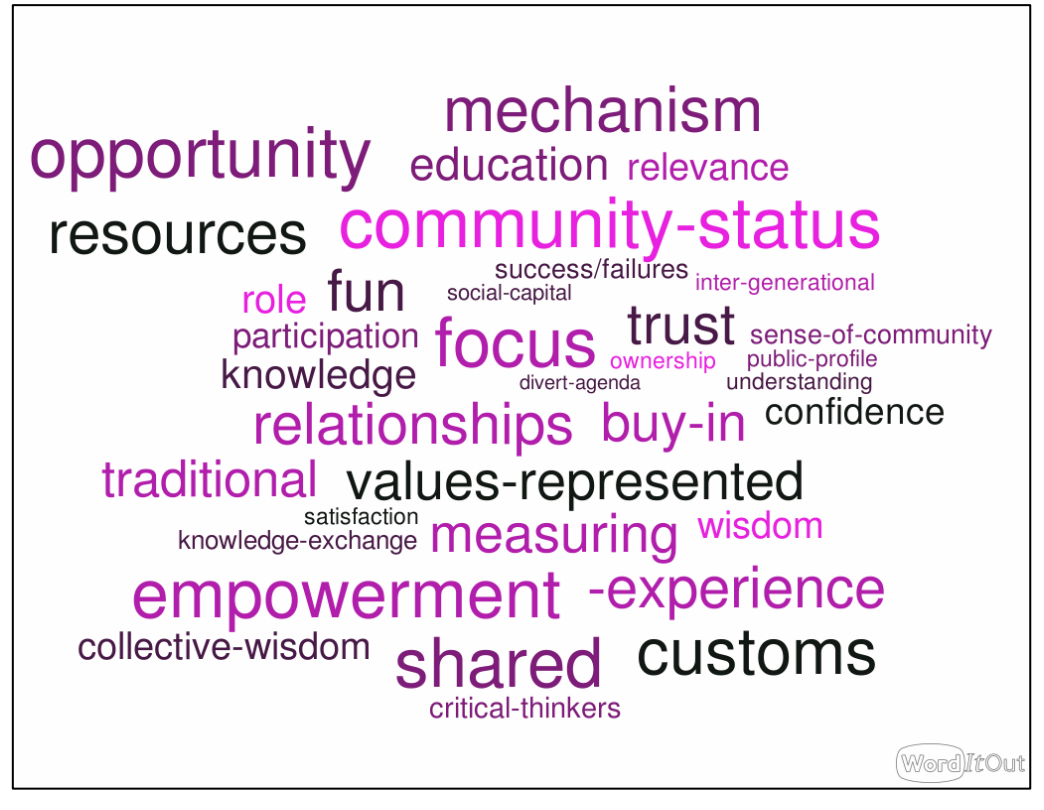
Figure 2: Benefits for citizens and communities.