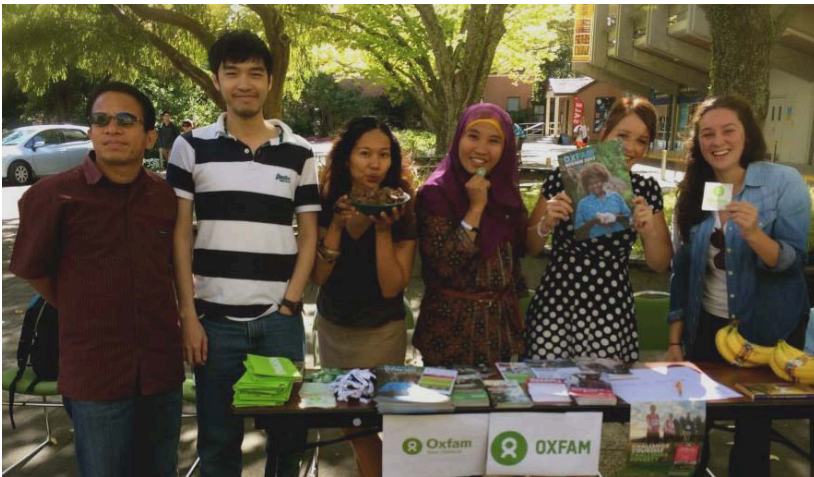
Some of the 'Oxfamily' (Oxfam at Massey students) at the Clubs and Societies day on the Manawatu Campus.

A good head and a good heart are always a formidable combination