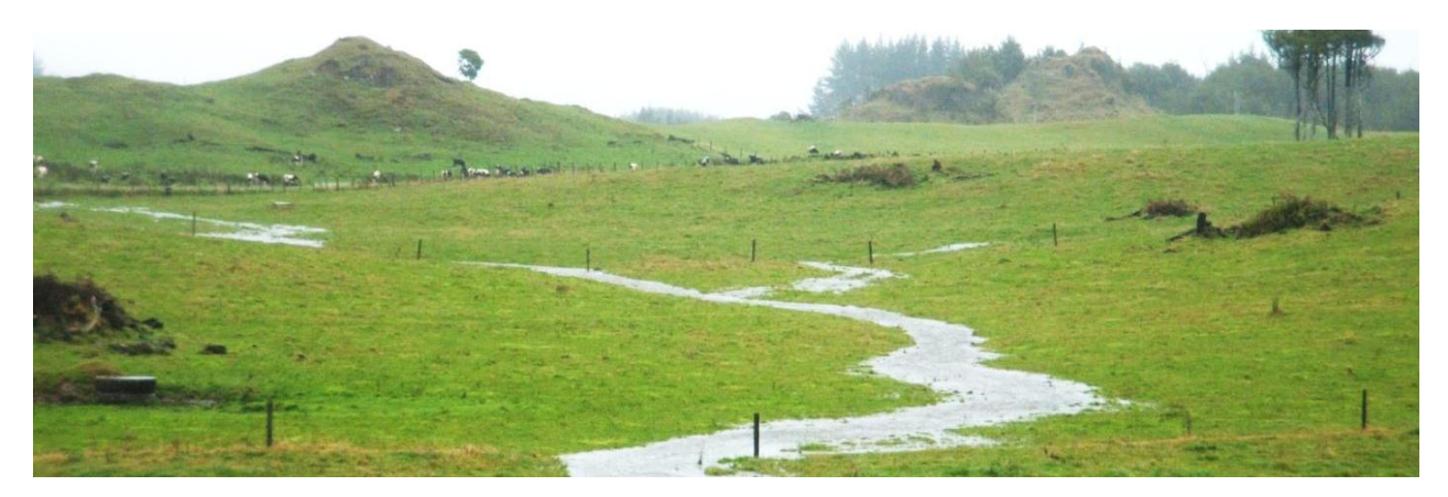
Figure 1: Overland flow in pastoral farmland in the Waiteti Stream catchment (a sub catchment of Lake Rotorua) after an intense rainfall event. This stream is entirely ephemeral as these paddocks are usually dry.

Diffuse-source phosphorus (P) loss from pastoral farmland via surface runoff is a challenging issue for land managers across the globe. Surface runoff (overland flow/ephemeral streams) is generated during rainfall when soil is saturated or infiltration capacity has been met (Figures 1 and 2). These ephemeral flows form in paddocks which are usually dry and they usually only flow for short periods of time (e.g. hours) in direct response to high intensity rainfall. They have the potential to transport a disproportionately large amount of sediment and nutrients from farm systems over short periods of time depending on land use in the contributing catchment.