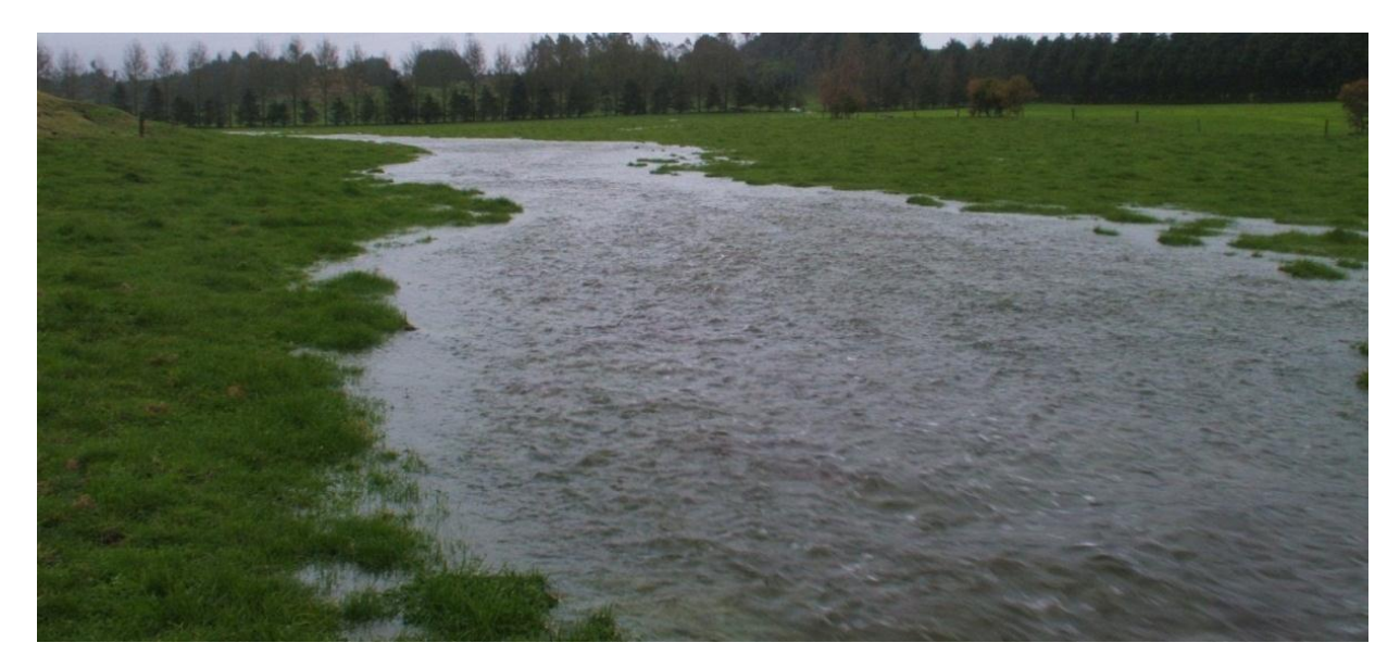
Figure 2: A large ephemeral stream in the upper Hauraki Stream catchment (a sub catchment of Lake Rotorua).

There is a range of mitigation tools available for attenuating nutrient and sediment loss via overland flow, each with strengths, weaknesses and variable cost effectiveness (McDowell & Nash 2012). Treating the large volume of water leaving a catchment during runoff events presents a challenge and many mitigation approaches struggle to cope with such large discharges over short periods of time. For example, 'break points' in riparian buffer strips can form where ephemeral flow paths intercept perpendicular to the strip and volumes are too great for water velocity to be reduced substantially by the vegetation, resulting in channelized flow through the riparian attenuation area (Cooper et al. 1990; Owens et al. 2007; Verstraeten et al. 2006). Grass filter strips can be effective for treating overland flow as long as water height is below the height of the grass. Once this height is exceeded then attenuation performance is reduced as grass is flattened (Cooper et al. 1990). Constructed wetlands often have a flood water diversion channels to avoid flood water inundation and damage such as at the large constructed wetland upstream of Lake Okaro in the Bay of Plenty (Tanner, 2003). If storm water is temporarily stored in upper catchment areas, then the above mentioned mitigation tools (and others) would potentially have a greater capacity to remove sediment and associated nutrients from water in overland flow.