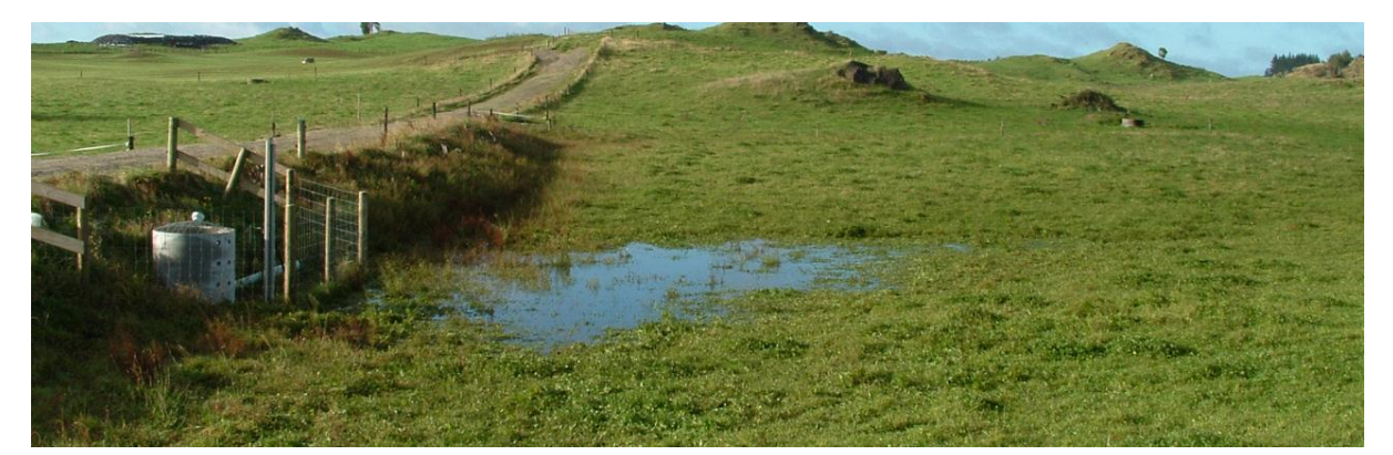
Figure 6: Residual water following a large ponding event at a detainment bund in the Waiteti Stream catchment, Rotorua. Note that the pasture appears undamaged. Photo: D. Clarke 2012.

Figure 5: A floating decant structure draining water from a DB in the Waiteti Stream catchment. Photo: D. Clarke 2012.