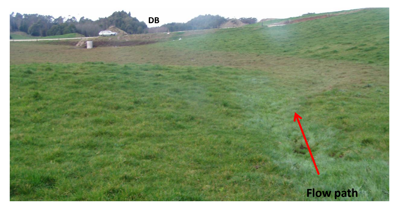
Figure 4: Evidence of sediment retention (visible on grass) after a ponding event at a detainment bund in the Awahou Stream catchment, July 2012. Note the ephemeral stream flow path (depicted by the arrow) in the foreground is completely clean. Photo: D. Clarke 2012.

Figure 3: A typical detainment bund in the Lake Rotorua catchment. Water has ponded behind the bund following a heavy rainfall event which produced surface runoff. This ponded water is slowly draining through the bund's outlet control structure while sediment and particulate nutrients settle from suspension. Photo: D. Clarke 2012.