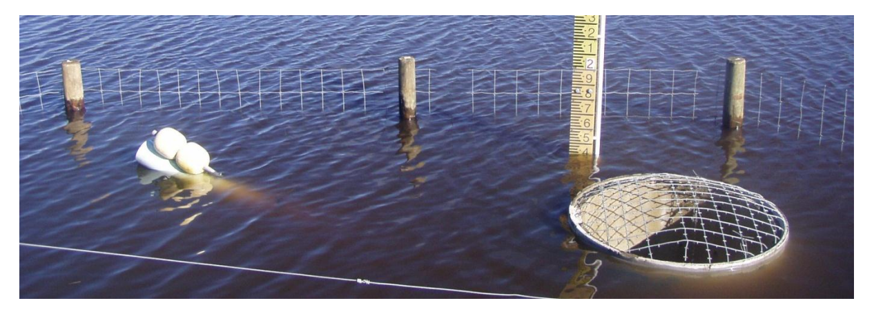
Figure 5: A floating decant structure draining water from a DB in the Waiteti Stream catchment.

Ponded water slowly drains from DBs via a floating decant system (Figure 5) which drains surface water until the ponding area is dry (Figure 6). The pasture in the ponding area is only inundated when sufficient intense rainfall produces runoff in the contributing catchment (c. 10 times per year in the Lake Rotorua catchment; Clarke, 2013).