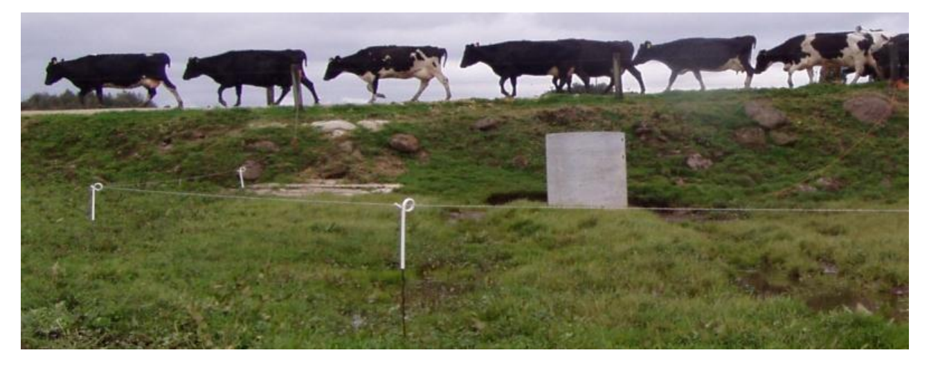
Figure 8: An example of good management of a DB in the Awahou Stream catchment as the ponding area has been temporarily fenced off from stock during wet periods.

There are several best management practices (BMPs) which can be followed when managing DBs. In the long term, DB basins are likely to be a P-sink so there may be no need for application of P fertiliser within the ponding area (Clarke, 2013). However, there may be a need for addition of readily–leached nutrients such as nitrogen and sulphur (A. Roberts, Ravensdown, Pers. comm. , 2012). Best practice in farming in New Zealand often involves the use of a spatially applied nutrient budgeting model (e.g. OVERSEER®) where a farm's various land management units or blocks are separately assessed for nutrient application, uptake and loss. The DB ponding areas could be treated as separate blocks in such nutrient budgeting models and lead to more efficient fertiliser application strategy in the farm's nutrient management planning. During wet periods it is advised to exclude stock from the ponding area, as shown in Figure 8.