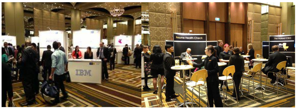
Stalls and attendees at the Career Expo

CPA Australia held a Career Expo in Auckland on Wednesday 13 August, from 5:30 to 8:00pm. Twenty employers took part in the Expo including KPMG, Fonterra, Auckland Council, Grant Thornton, IBM, Goodman Fielder, BNZ, ASB and others. It attracted a lot of interest and was very well attended. The venue was the Pullman Hotel in Auckland.