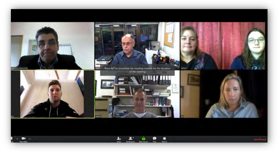
A meeting of volunteer distance students, School staff, and the coordinator of Community Accounting.

The School of Accountancy in collaboration with Auckland Community and Development (ANCAD), the School has launched a new initiative for distance students: Community Accountancy Aotearoa.