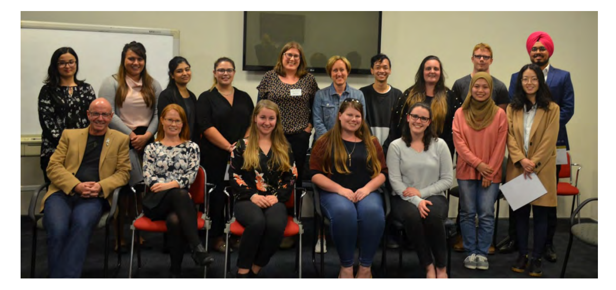
Members of the Palmerston North Community Accounting 2018.