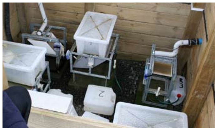
An effluent drainage monitoring station used on Massey's No 4 Dairy Farm near Palmerston North

Harmonic Ltd is commercialising the system, and plan to make the package available on-farm in 2010. Current work is funded by Harmonic, Horizons Regional Council, the Foundation for Research, Science and Technology and the Dairy NZ On-Farm Innovation Fund. ❖