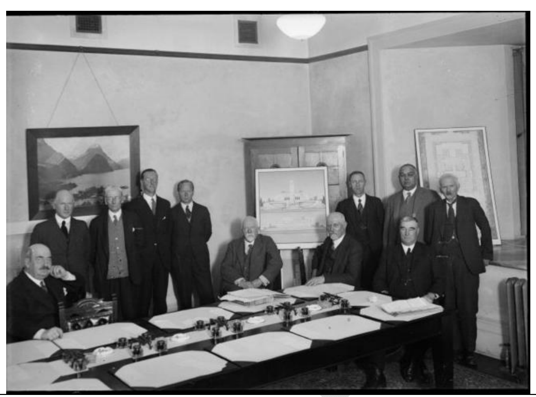
Dominion Museum Committee. Negatives of the Evening Post newspaper. Ref: EP-3876-1/2-G. Alexander Turnbull Library, Wellington, New Zealand, accessed 3/5/2013, <a href="http://natlib.govt.nz/records/23252624">http://natlib.govt.nz/records/23252624</a>

The Mt Cook gaol was demolished and construction of the first structure — the Carillon, which was opened in 1932 (the hall of memories was not officially completed until 1964) began. The construction of the museum building began in 1933 to Gummer and Ford's design, a monumental and imposing structure of three storeys in the Stripped Classical style. It was constructed in reinforced concrete and partially faced with Putaruru stone. The roof was clad with copper sheathing and glass. A large central portico supported by square fluted pillars dominates the main façade.