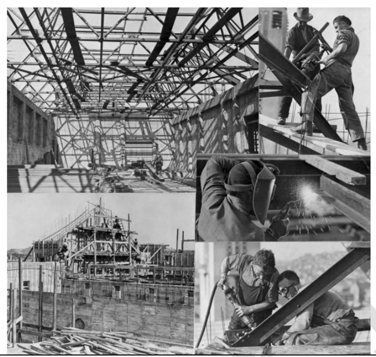
Montage of images showing the Dominion Museum under construction, Buckle Street, Wellington.