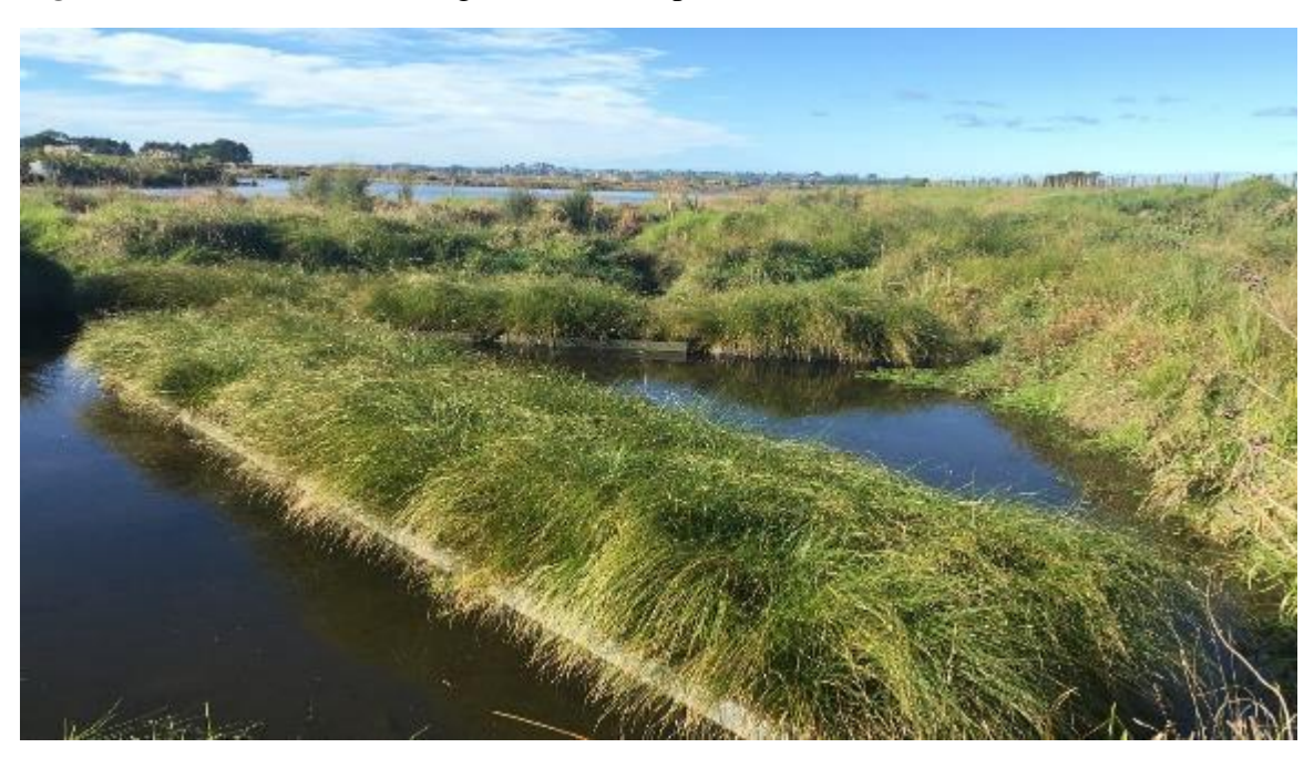
Figure 3: BoPRC demonstration site with floating wetlands of Carex secta.

Plant species were selected based on a number of criteria including: likelihood of surviving and growing in an aquatic and potentially saline environment with high sunlight and warm temperatures; availability and suitability of plants to fit in the one litre pots used on the FTWs; usefulness of the species to yield a product with commercial or cultural value; and species likely to take up and hold nutrients from the drain water.