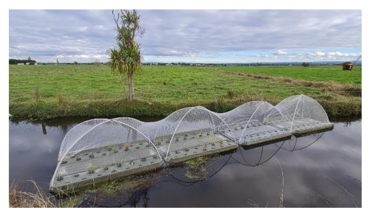
Figure 2: Trial site and floating wetland set-up.