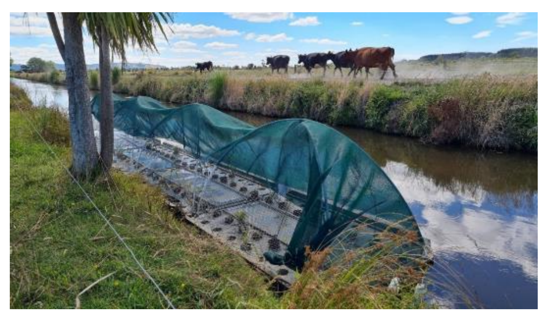
Figure 4: Trial 2 site and FTW set-up.

Twelve replicates of each of the nine species were established as a randomised complete block design. They were placed in the FTWs on 28 January 2021 in double pots to raise the plant height above the water level, and shade cover installed (Figure 4). Plant heights and diameters were recorded.